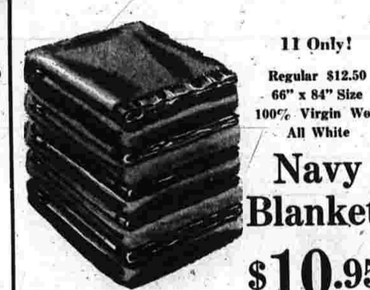
(Not exactly as illustrated).

Reg. $10.50 Extra Size 80x84 Washable Patchwork Quilts $8.98 Calico Fan pattern in rose, blue and green.