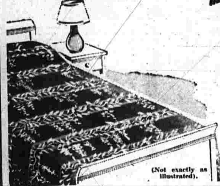
(Not exactly as illustrated).

Chenille Bedspreads White grounds with multi-color floral designs in rose, blue, green, gold, and peach. Two patterns. Reg. $10.98 $8.98